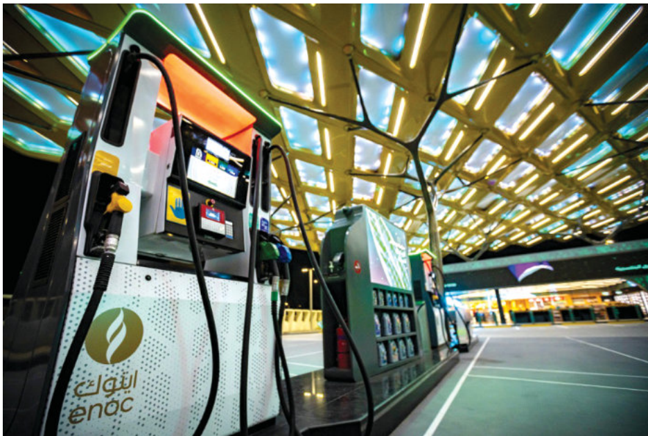
Gilbarco Veeder-Root Fuel Dispenser